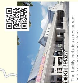
Kibi Plaza The facility includes a restaurant and a convenience store.