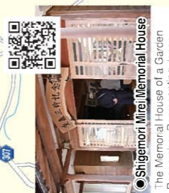
Shigemori Mirei Memorial House The Memorial House of a Garden Researcher Representing Japan.