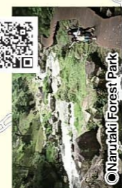
Narutaki Forest Park Why don't you refresh your body and soul at the season tasteful valley?

Altitude: 329m Continuous Up/Down hill zone About 4.8km Different in height/229m Average gradient/About 4.2% Altitude/100m