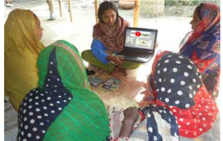
Maternal/child health session using ICT