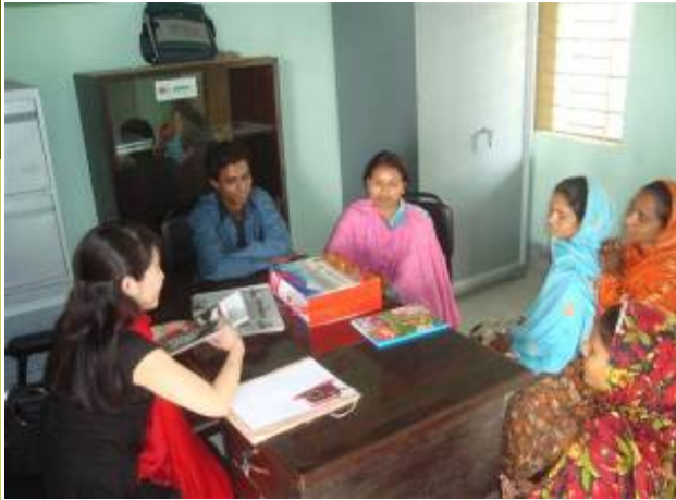
Resource room/ library