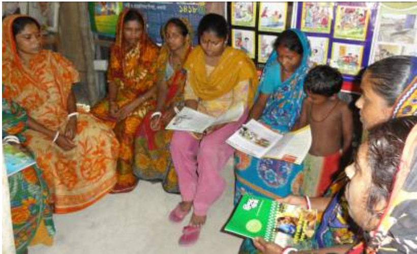
Education for all age groups