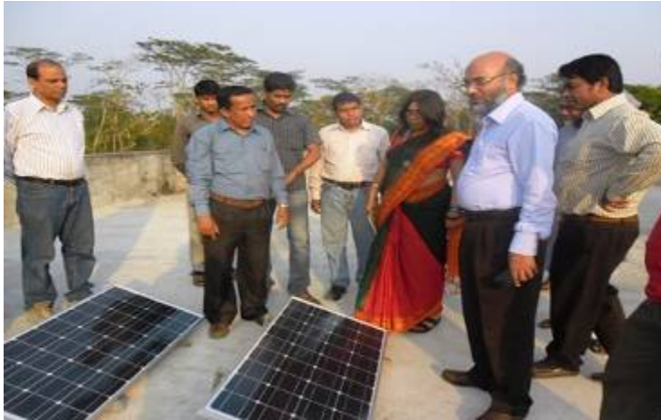
Solar plant for electricity in rural Ganokendra