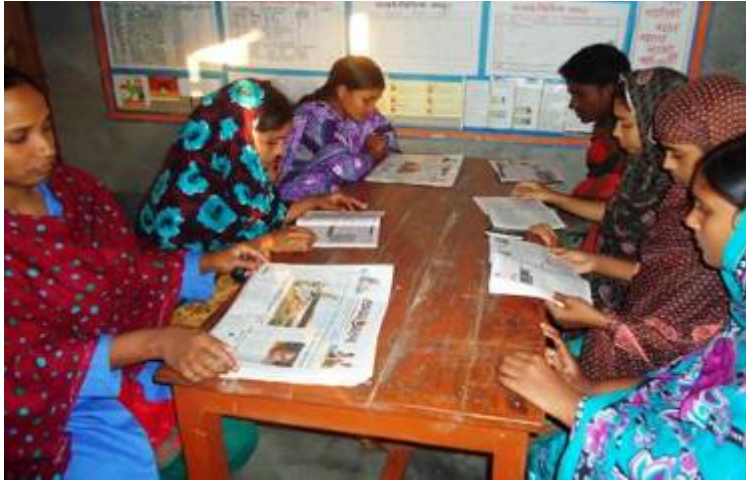
Young & Adolescent Literacy