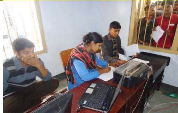
Submitting form for getting passport