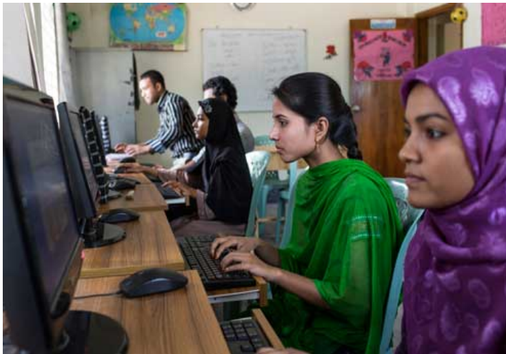
Internet access for information