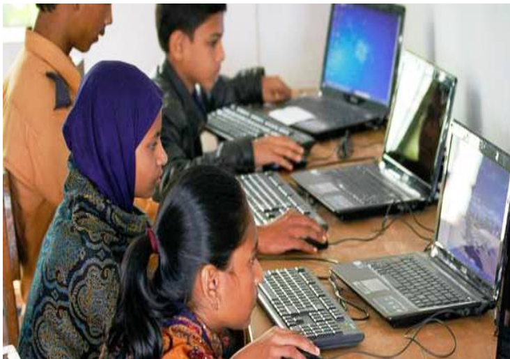
Women/adolescent Literacy using ICT