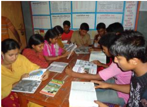
NFE class & lifelong learning