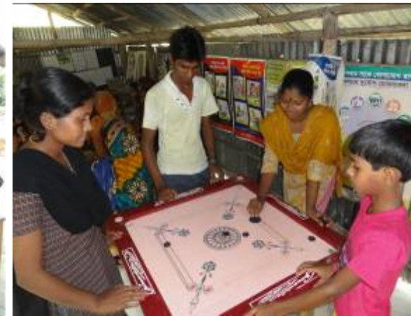
Extra curricular activities