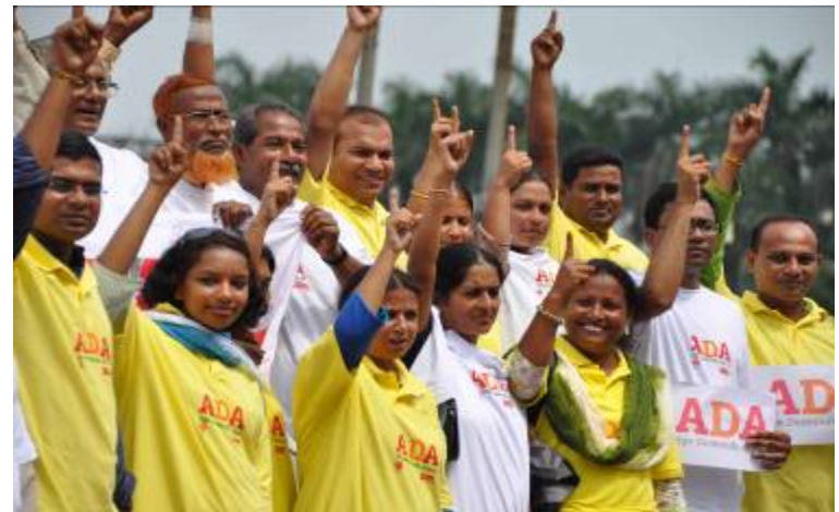
Rights/ Environment & Climate Change