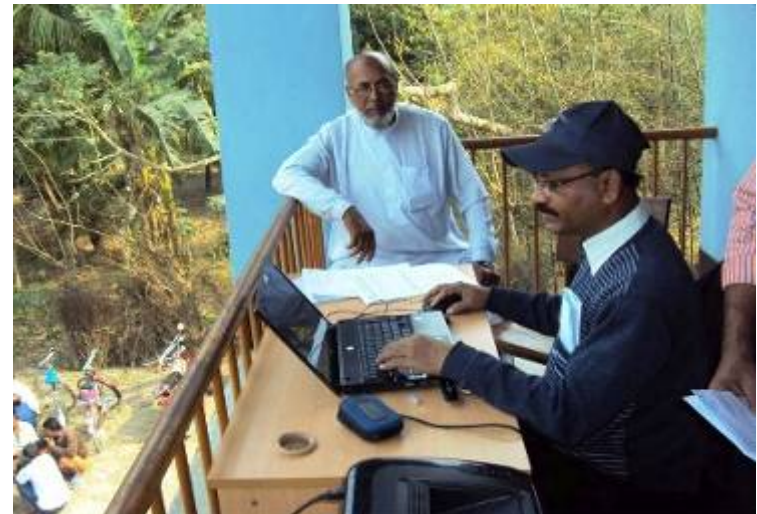
Farmer taking info