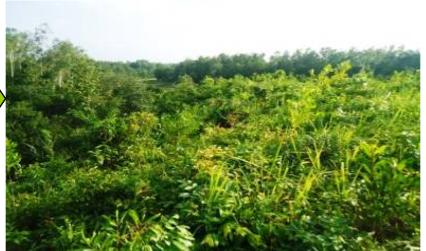
Before Ganokendra/community initiatives