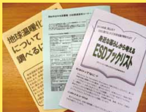
ESD book list