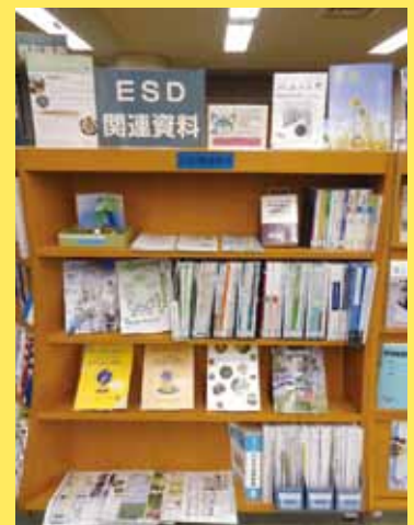
ESD-related material section