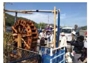
Takebe Natural Energy Stroll