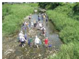
Ashimori Waterside Study