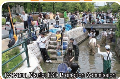
Kyoyama District ESD Promotion Commission

Residents take initiative for local challenges. They learn and act together