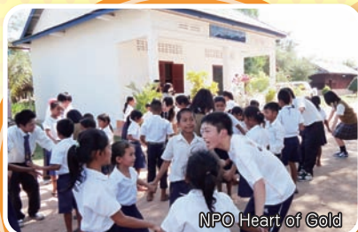
NPO Heart of Gold

Projects that teach about sustainable living, peace and the environment