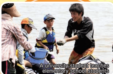
A university student teaches elementary school students

Promote research and involve the young in social action