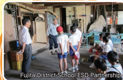
Fujita District School ESD Partnership

Local residents and students plan for the future